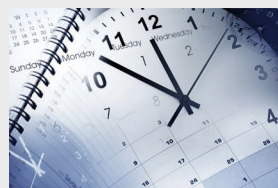
Time & Attendance