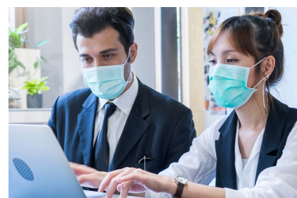
Epidemic prevention and control