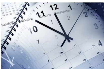
Time & Attendance