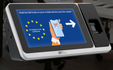
Zpad Plus [QR]

ZPad Plus Series are ZKTeco's latest multi-functional data collection device, incorporating the Android 7.1 platform and integrating FBI PVI certified Z-ID Fingerprint Sensor, RFID module and QR module(Optional).Support 4G function. The device is equipped with an internal battery and a 7-inch touch screen display and features wireless communications via Wi-Fi and Bluetooth.